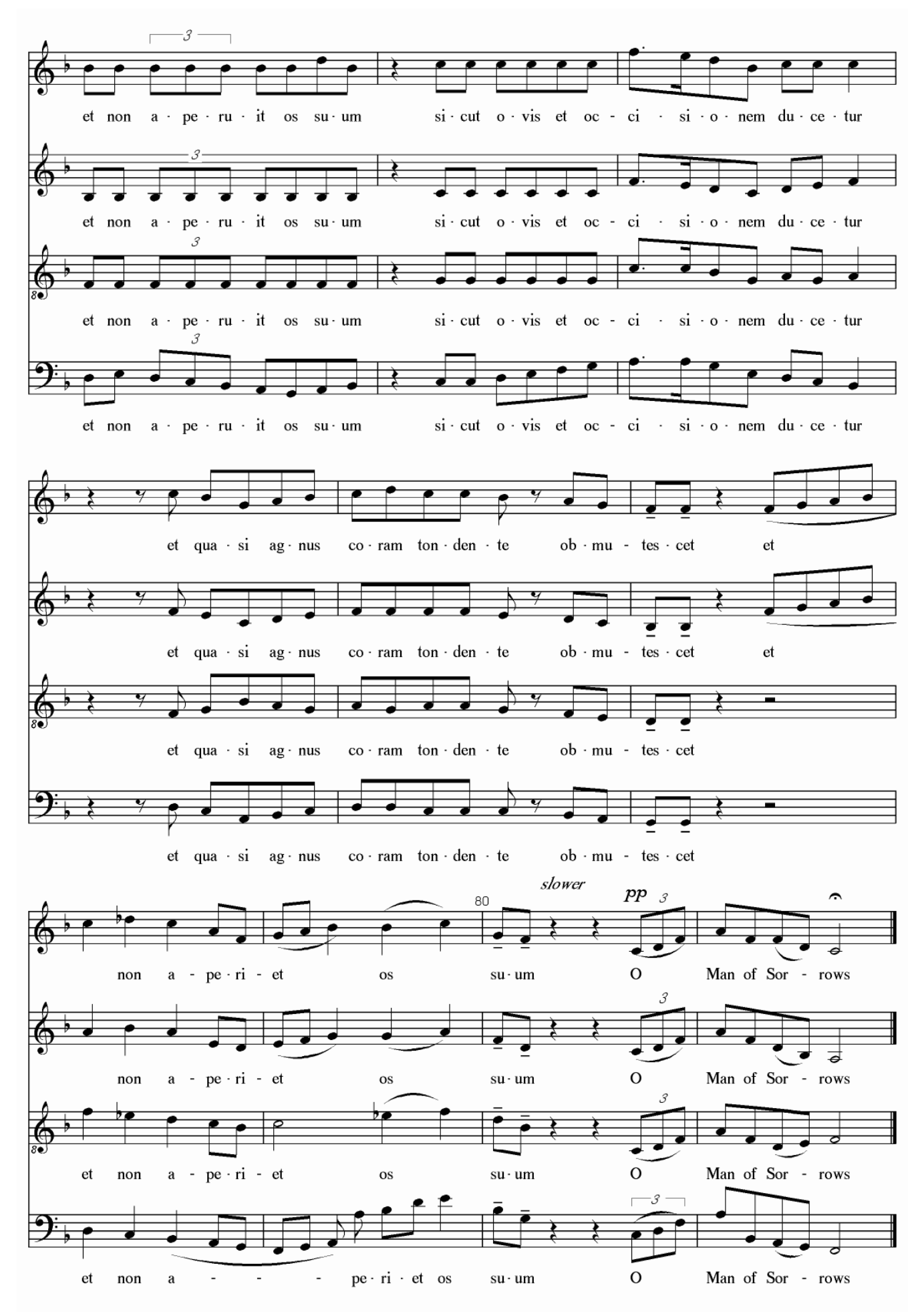
© 2004 F L Dunkin Wedd If this work is to be performed, please inform the composer in advance