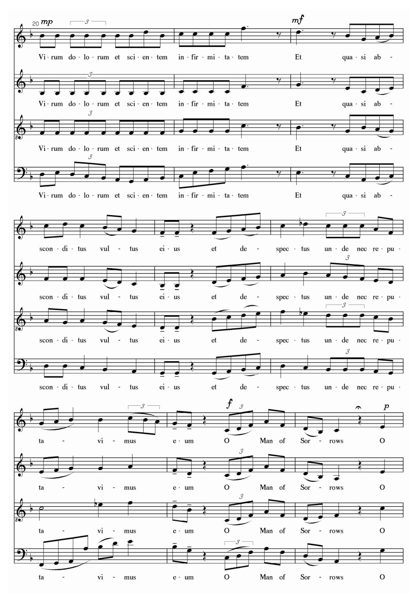
© 2004 F L Dunkin Wedd If this work is to be performed, please inform the composer in advance