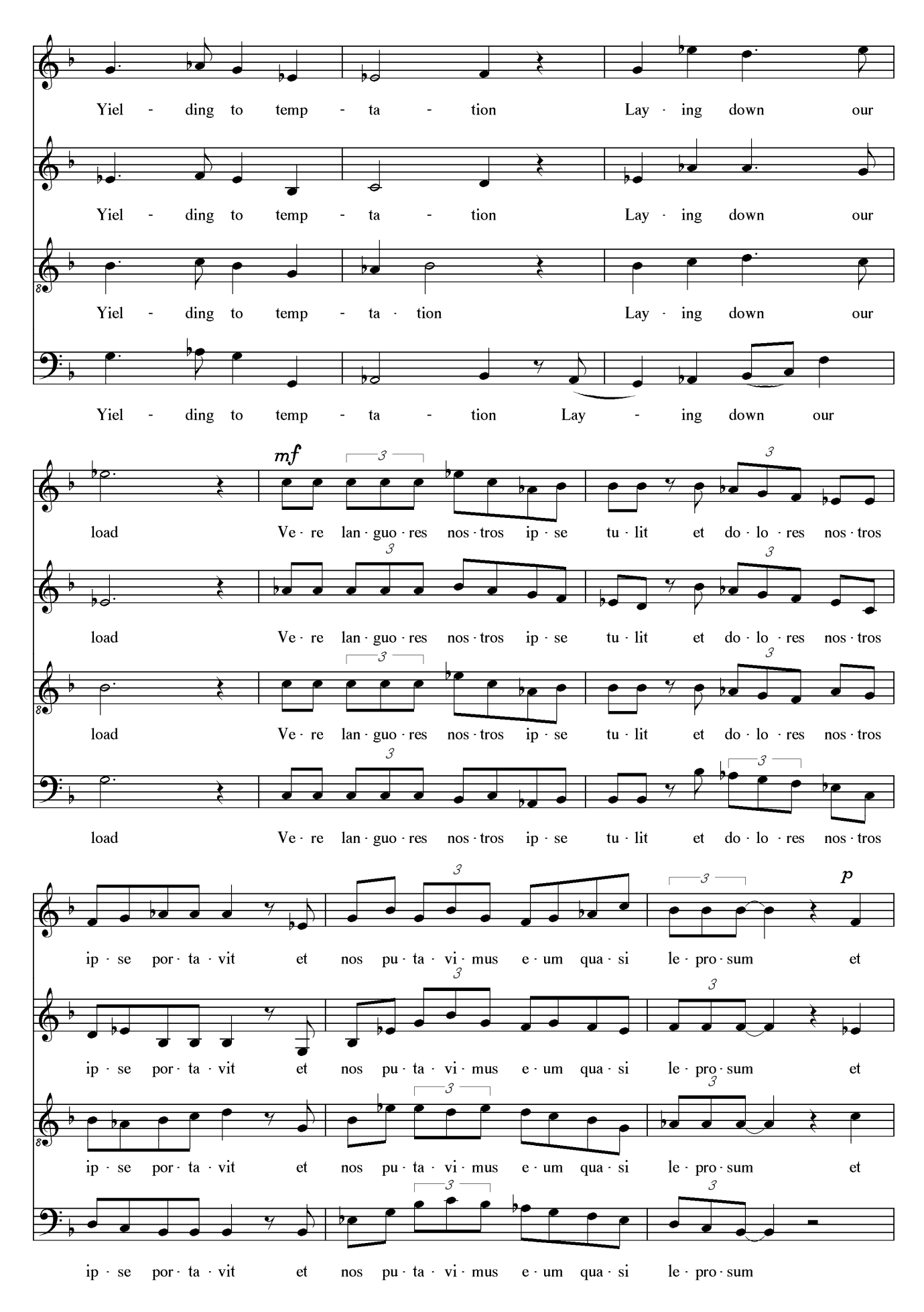
© 2004 F L Dunkin Wedd If this work is to be performed, please inform the composer in advance