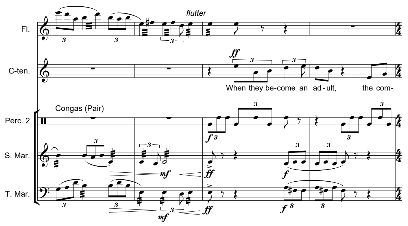
Copyright © 2017 by Malcolm Dedman