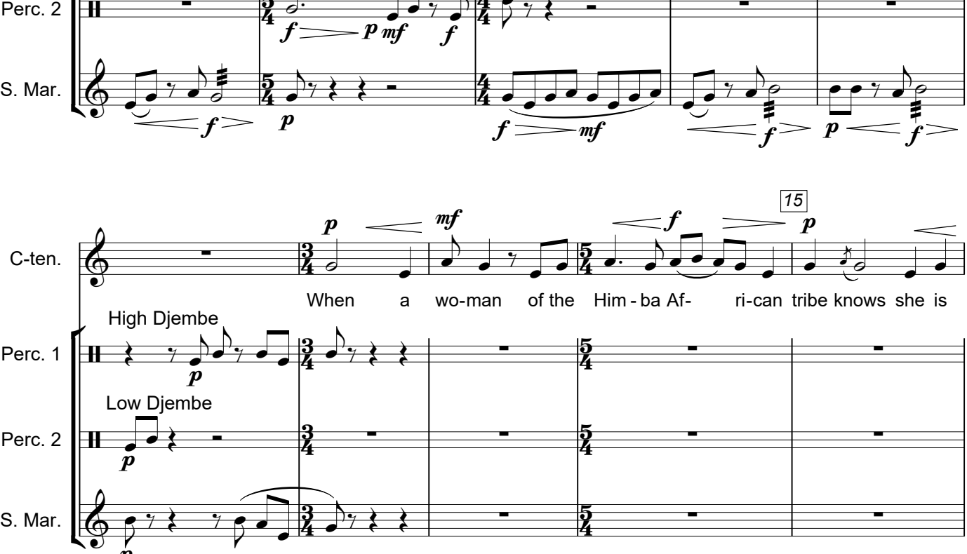
Copyright © 2017 by Malcolm Dedman