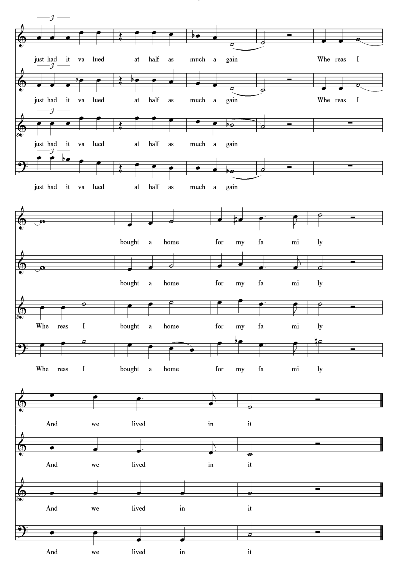
© 2004 F L Dunkin Wedd If you are performing this work, please inform the composer in advance