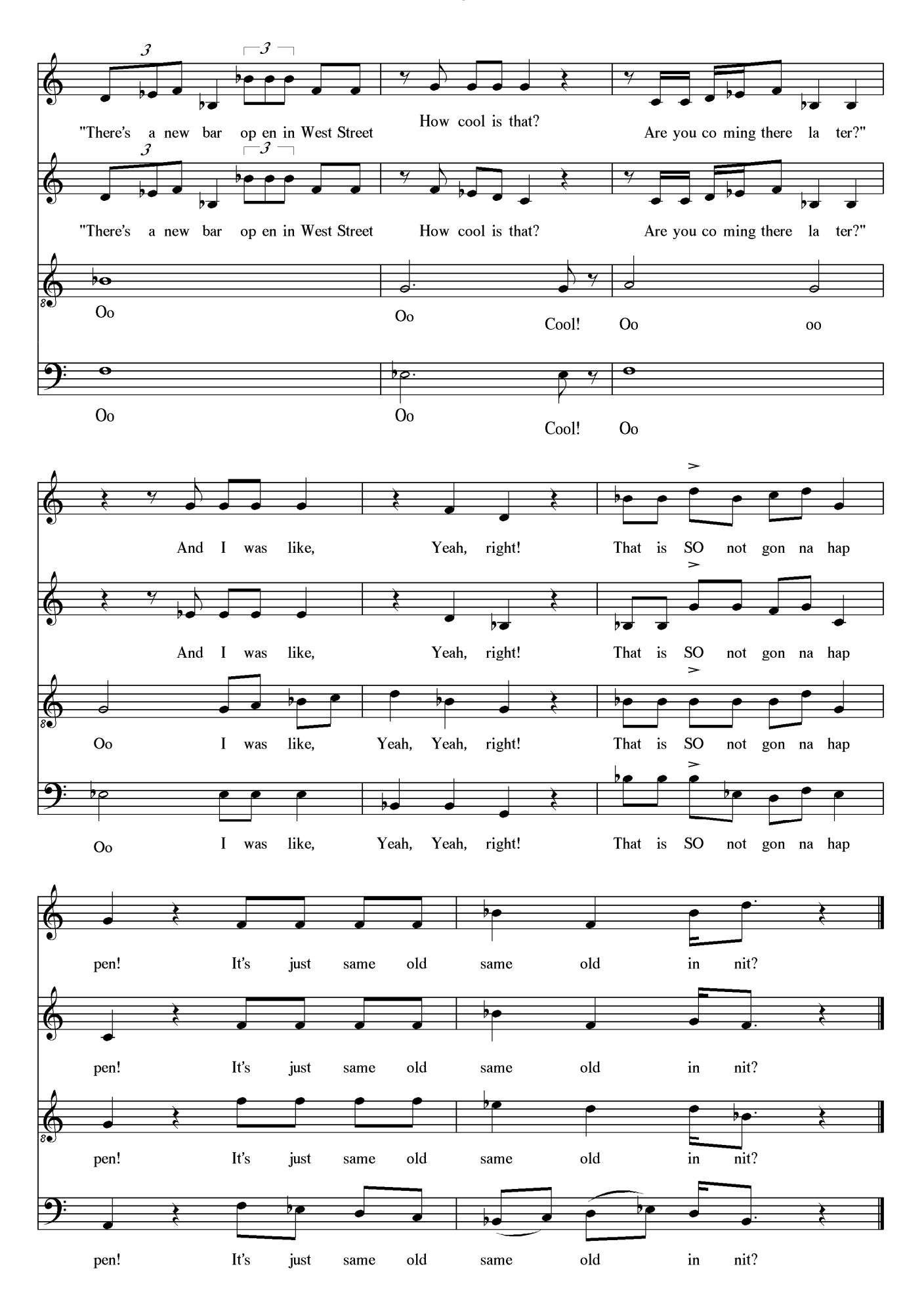
© 2004 F L Dunkin Wedd If you are performing this work, please inform the composer in advance