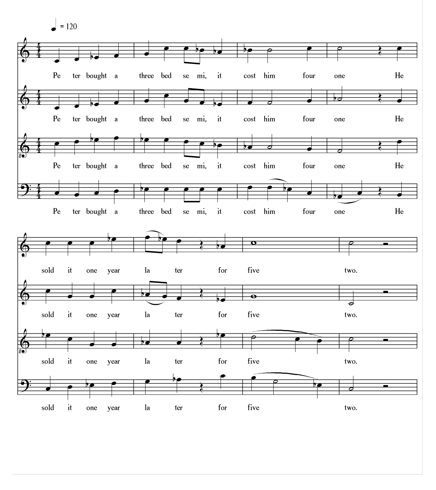
© 2004 F L Dunkin Wedd If you are performing this work, please inform the composer in advance