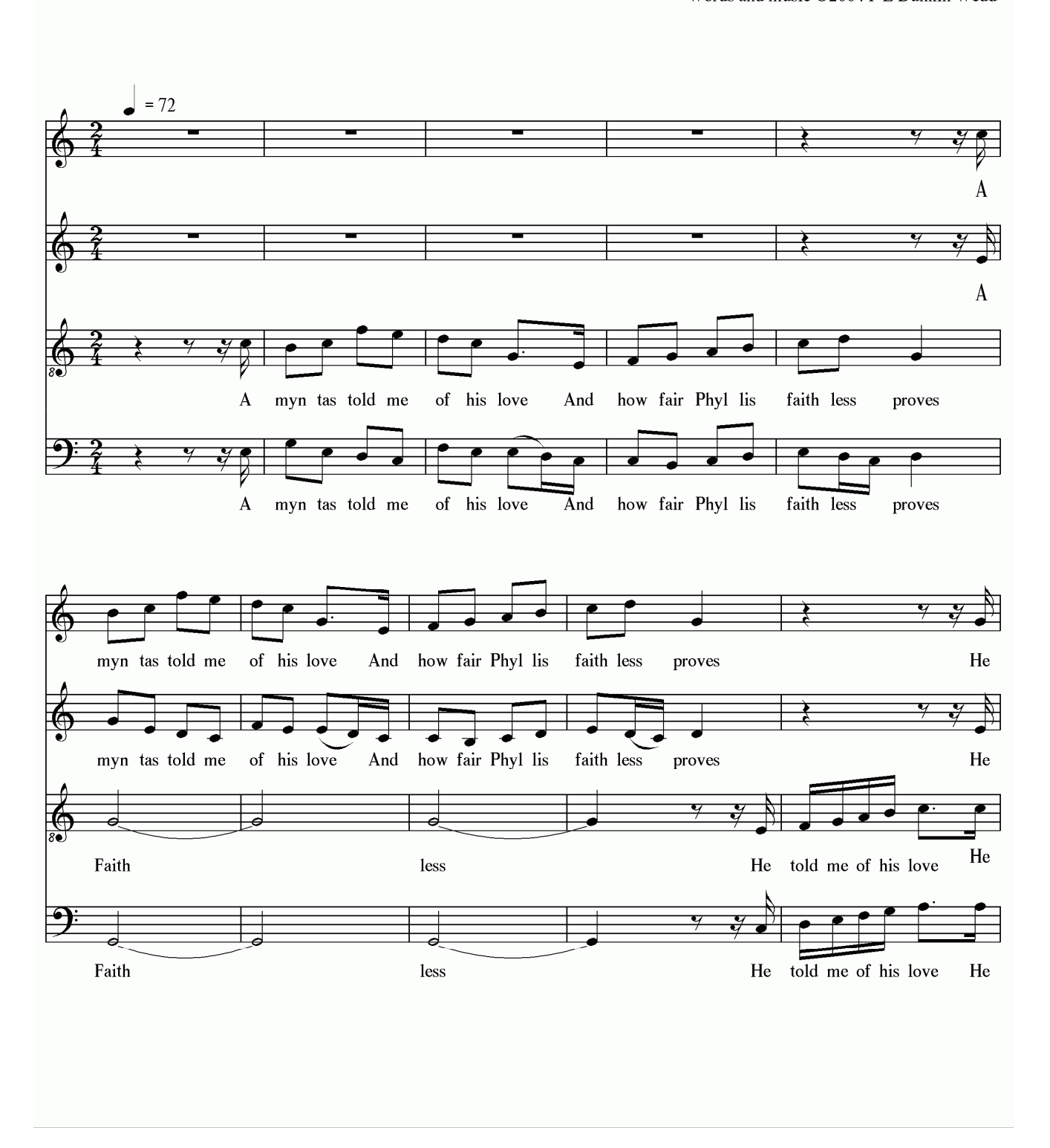
© 2004 F L Dunkin Wedd If you are performing this work, please inform the composer in advance