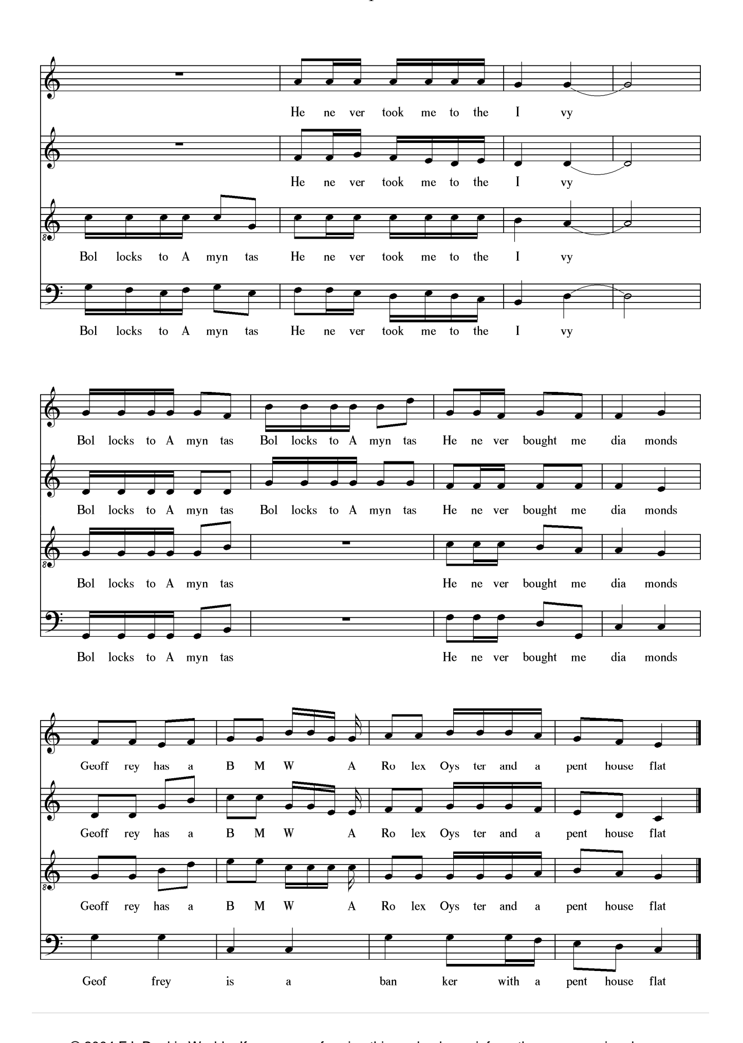
© 2004 F L Dunkin Wedd If you are performing this work, please inform the composer in advance