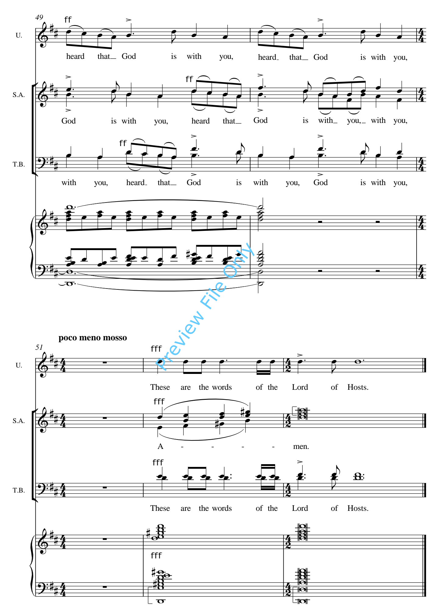
Colchester, February 2003