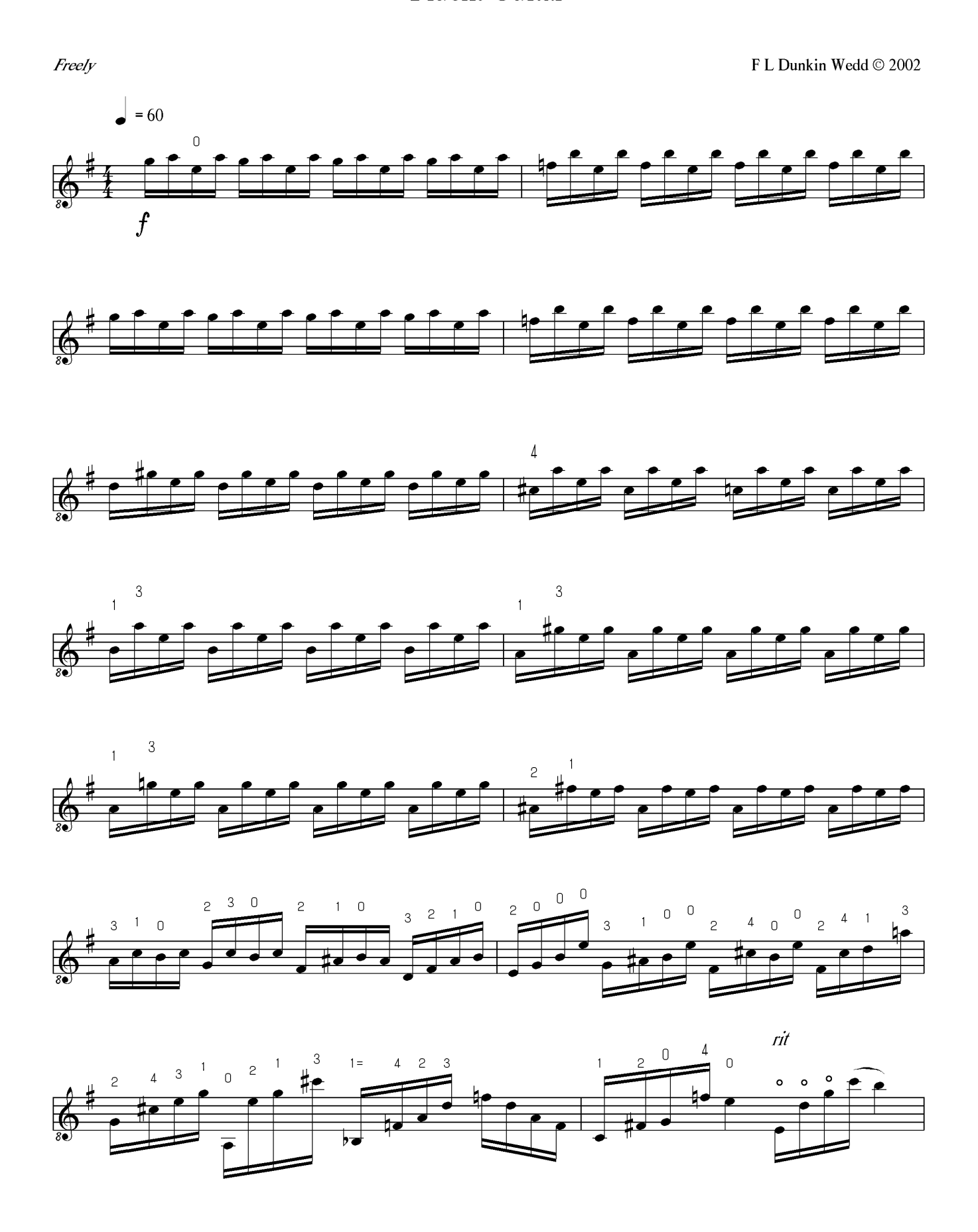
© 2002 F L Dunkin Wedd If this work is to be performed, please inform the composer in advance