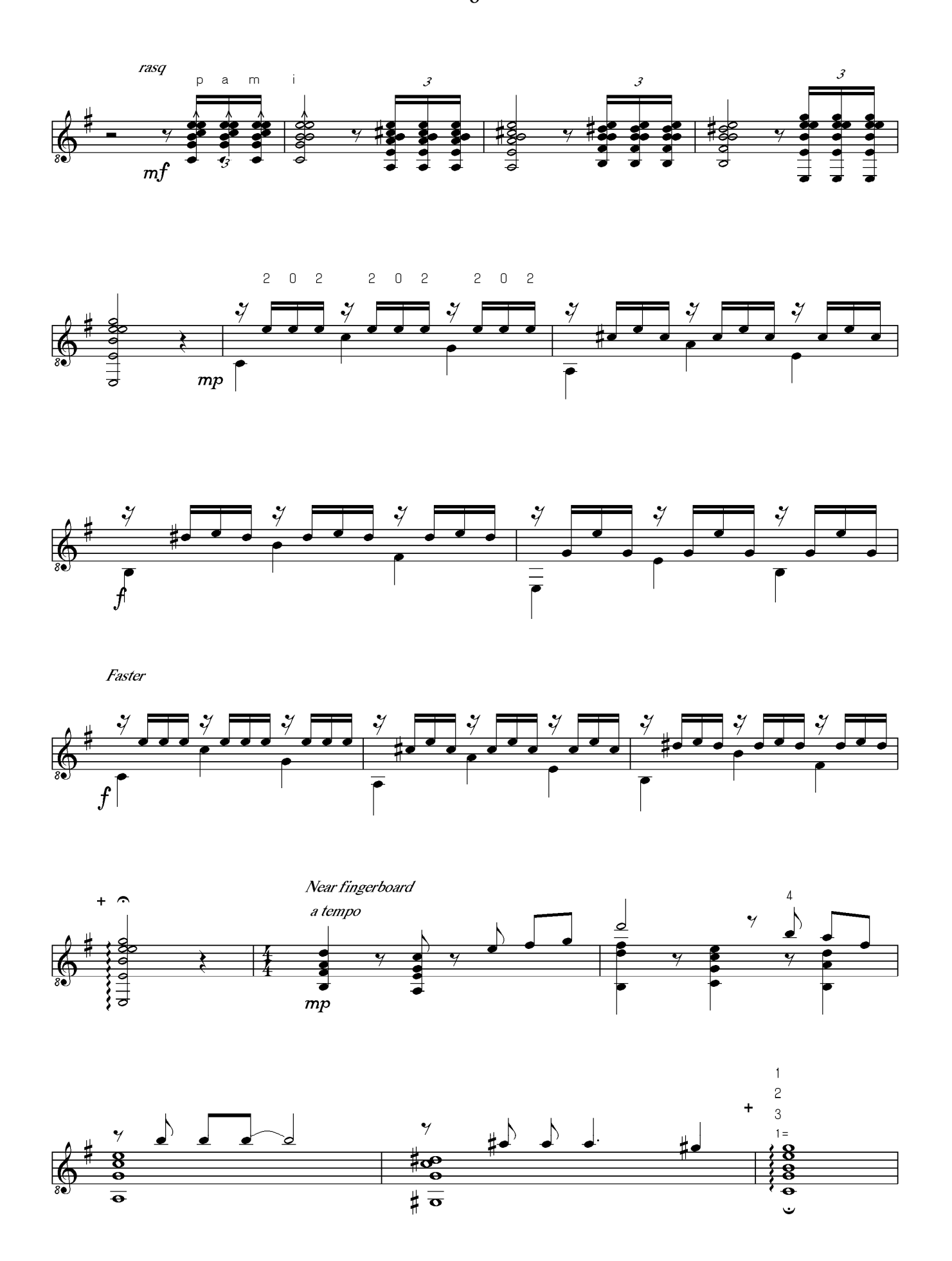
© 2002 F L Dunkin Wedd If this work is to be performed, please inform the composer in advance