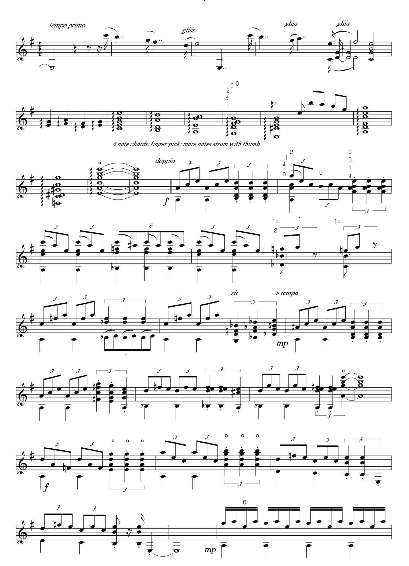
© 2002 F L Dunkin Wedd If this work is to be performed, please inform the composer in advance