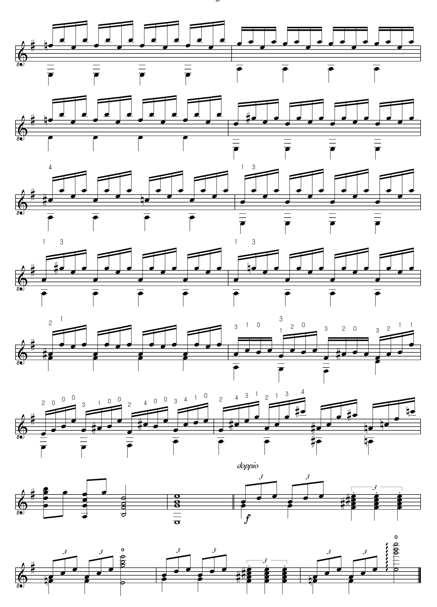
© 2002 F L Dunkin Wedd If this work is to be performed, please inform the composer in advance