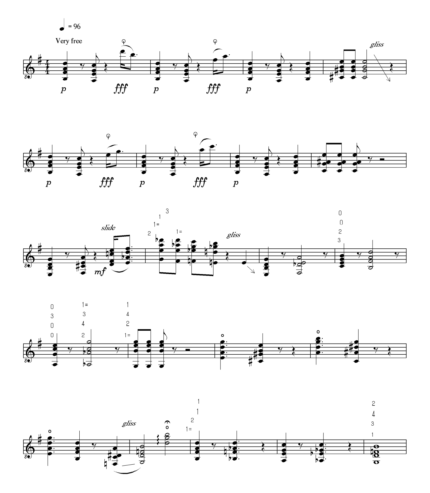
© 2002 F L Dunkin Wedd If this work is to be performed, please inform the composer in advance