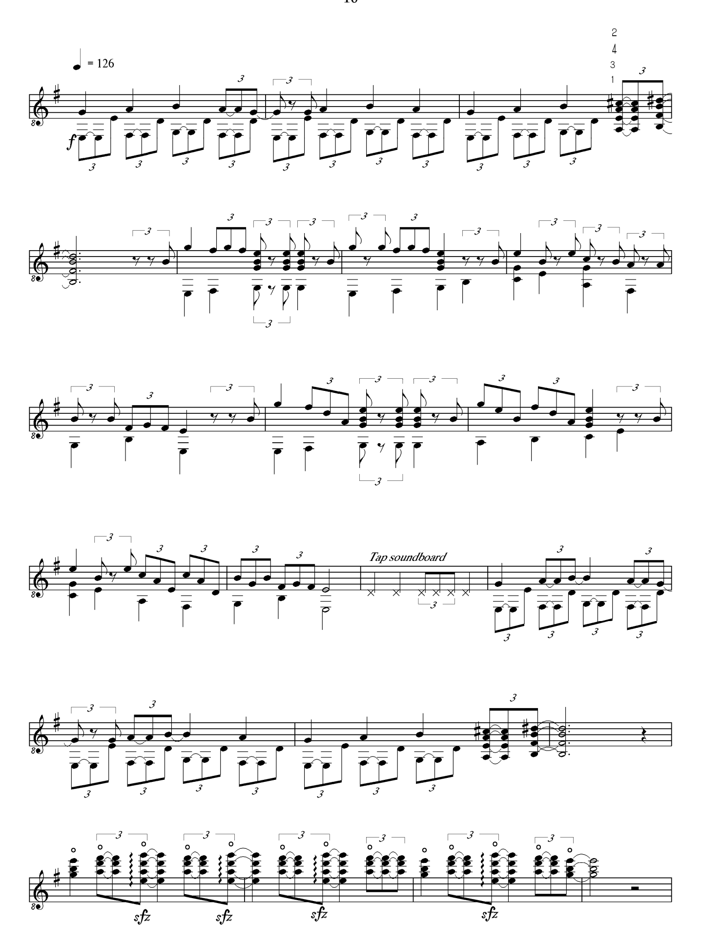
© 2002 F L Dunkin Wedd If this work is to be performed, please inform the composer in advance