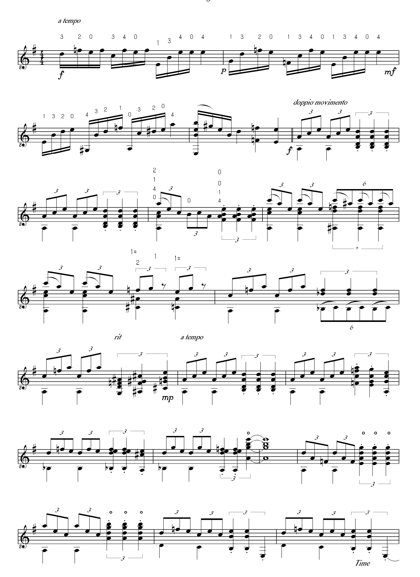
© 2002 F L Dunkin Wedd If this work is to be performed, please inform the composer in advance