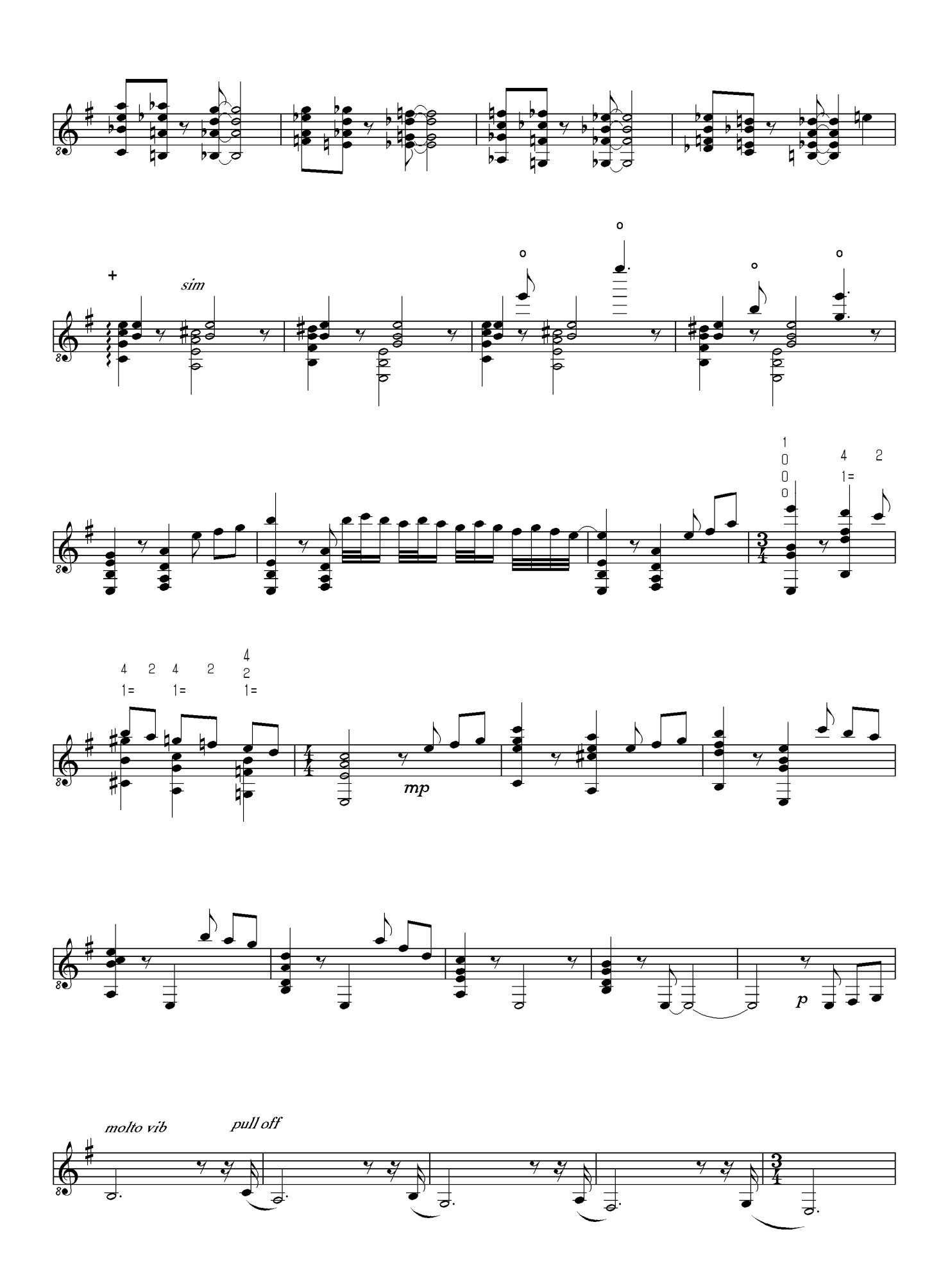
© 2002 F L Dunkin Wedd If this work is to be performed, please inform the composer in advance