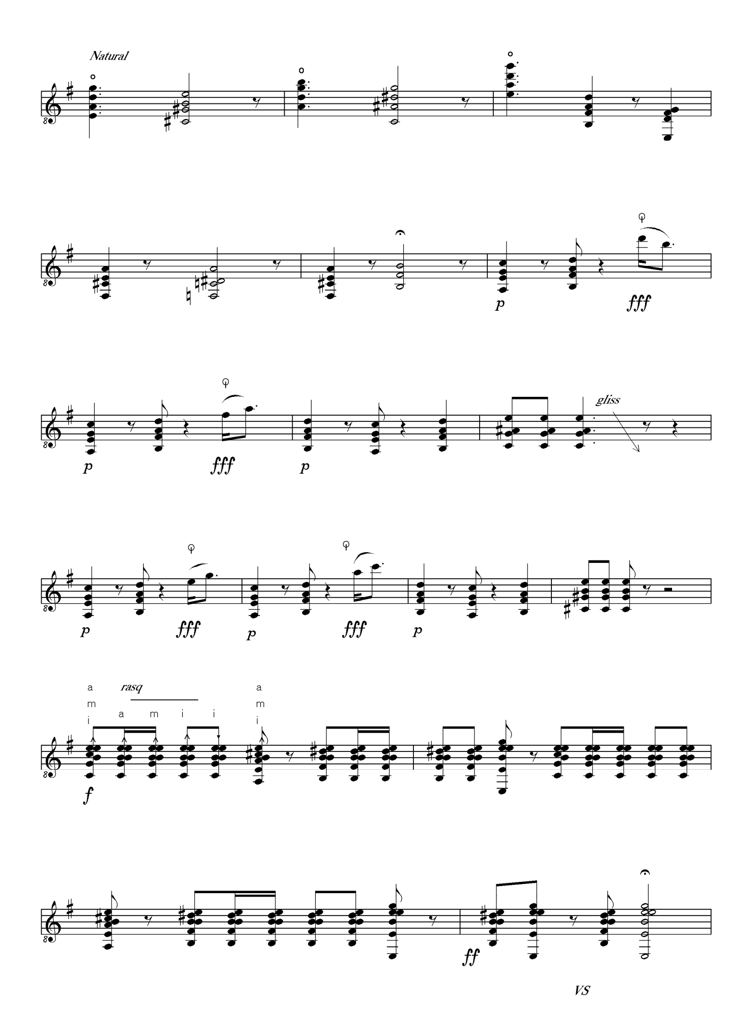
© 2002 F L Dunkin Wedd If this work is to be performed, please inform the composer in advance