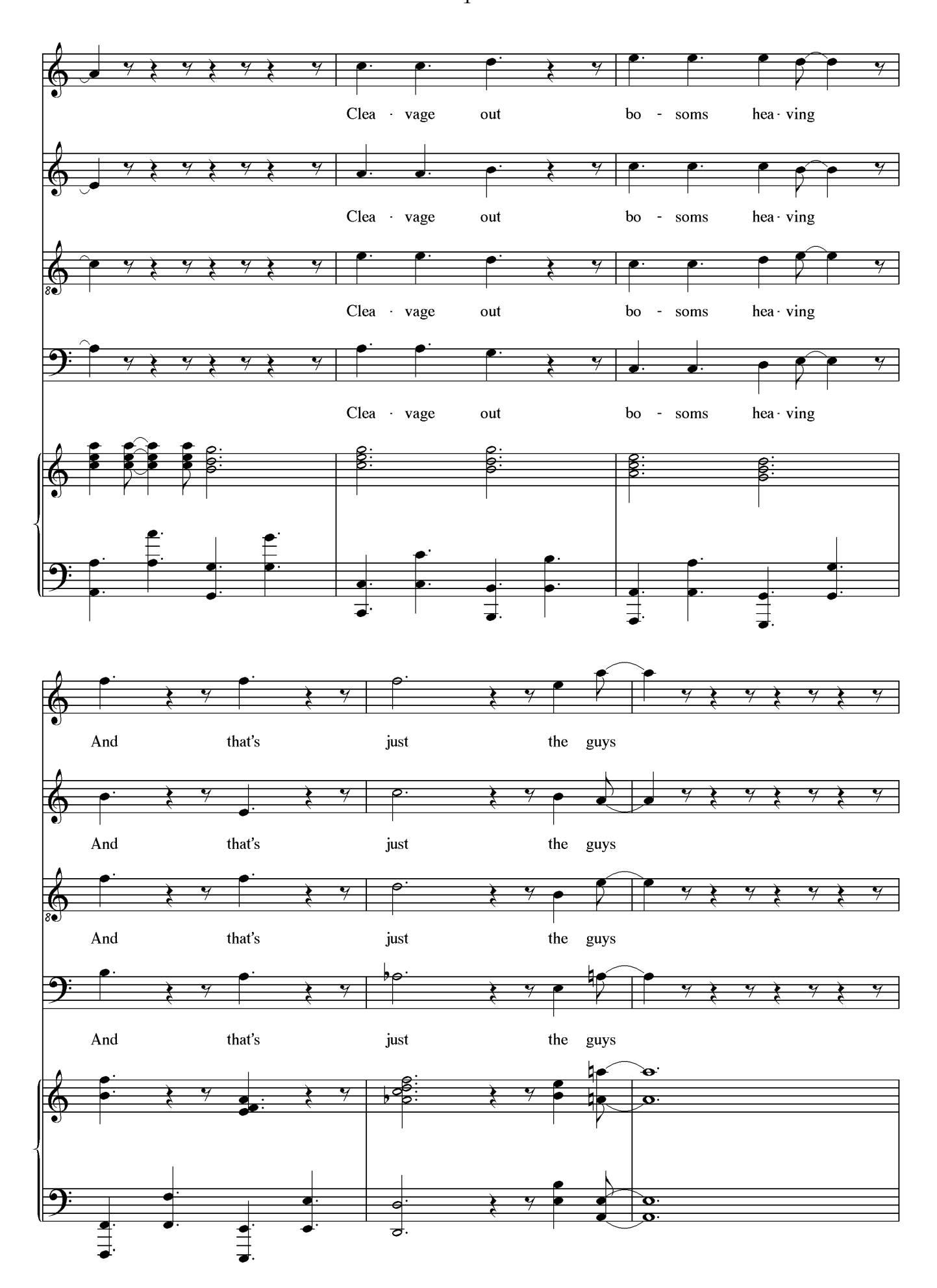
© 2009 F L Dunkin Wedd If this work is to be performed, please inform the composer in advance