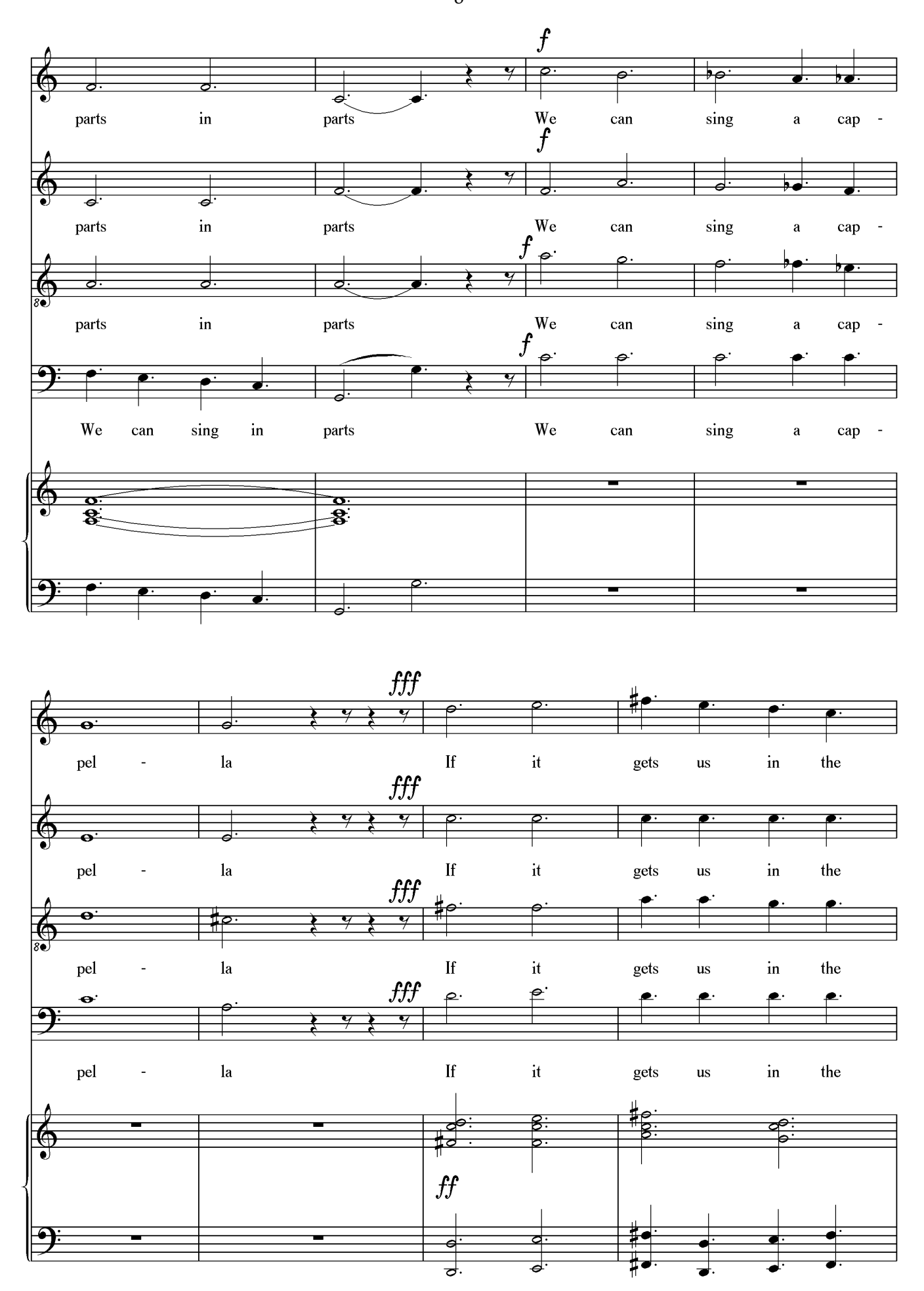
© 2009 F L Dunkin Wedd If this work is to be performed, please inform the composer in advance