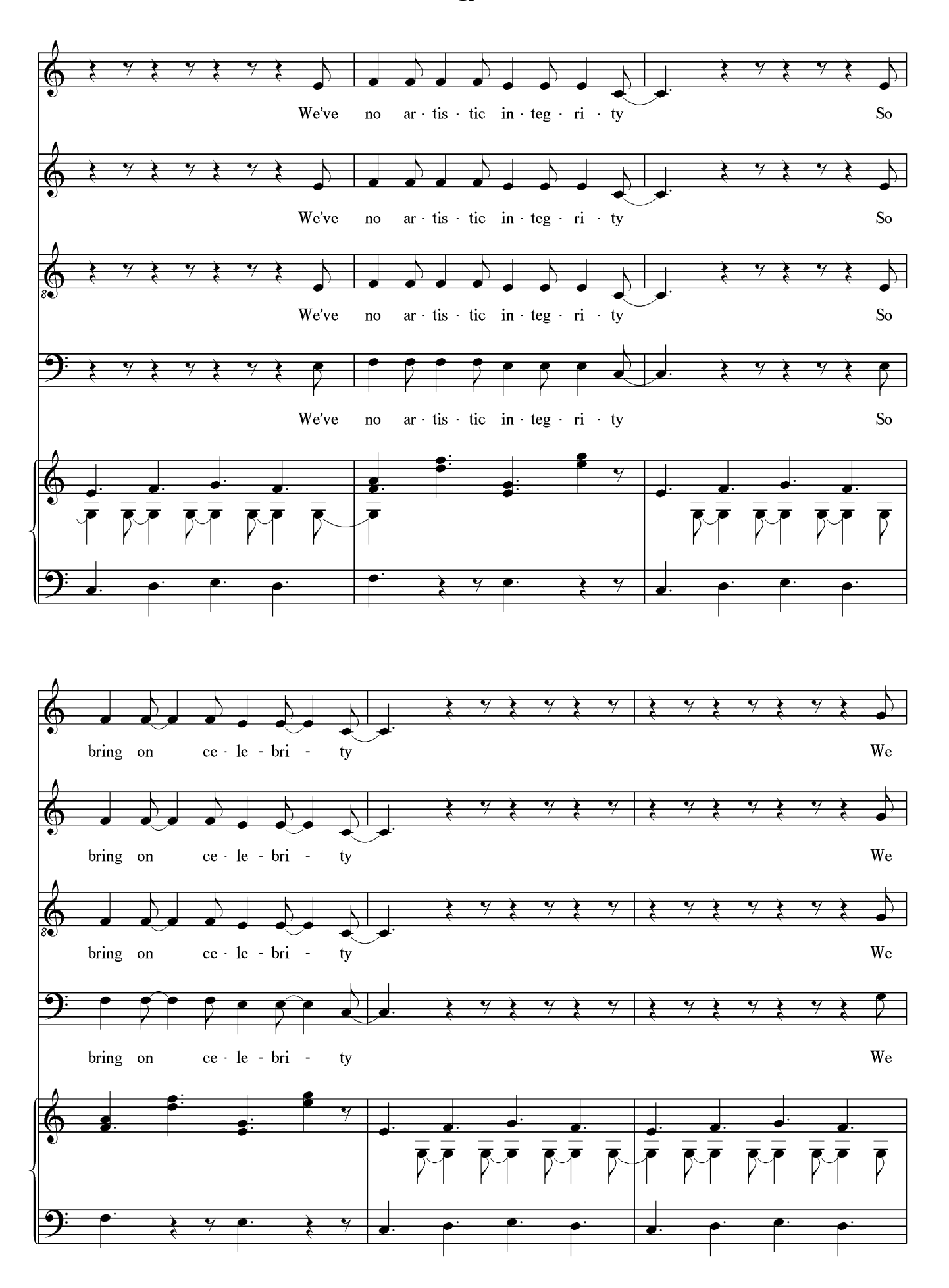
© 2009 F L Dunkin Wedd If this work is to be performed, please inform the composer in advance