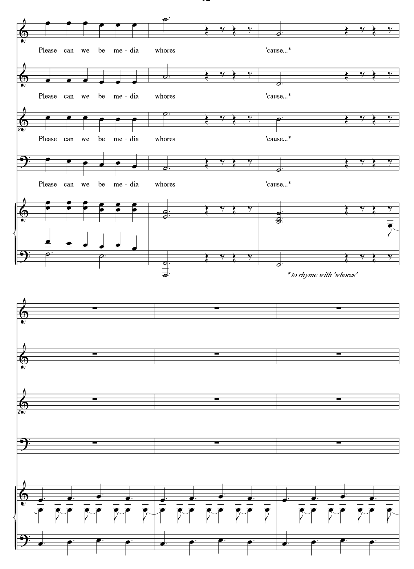
© 2009 F L Dunkin Wedd If this work is to be performed, please inform the composer in advance