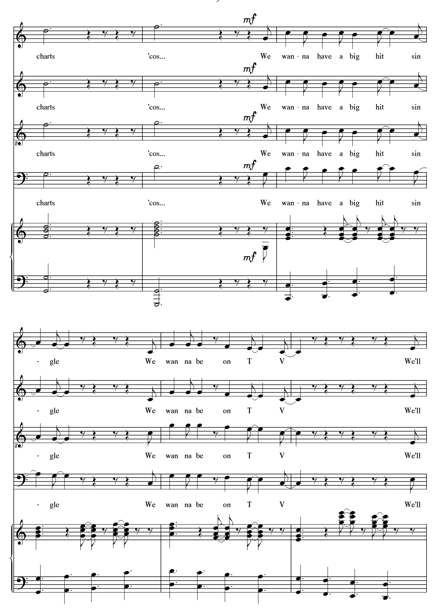
© 2009 F L Dunkin Wedd If this work is to be performed, please inform the composer in advance