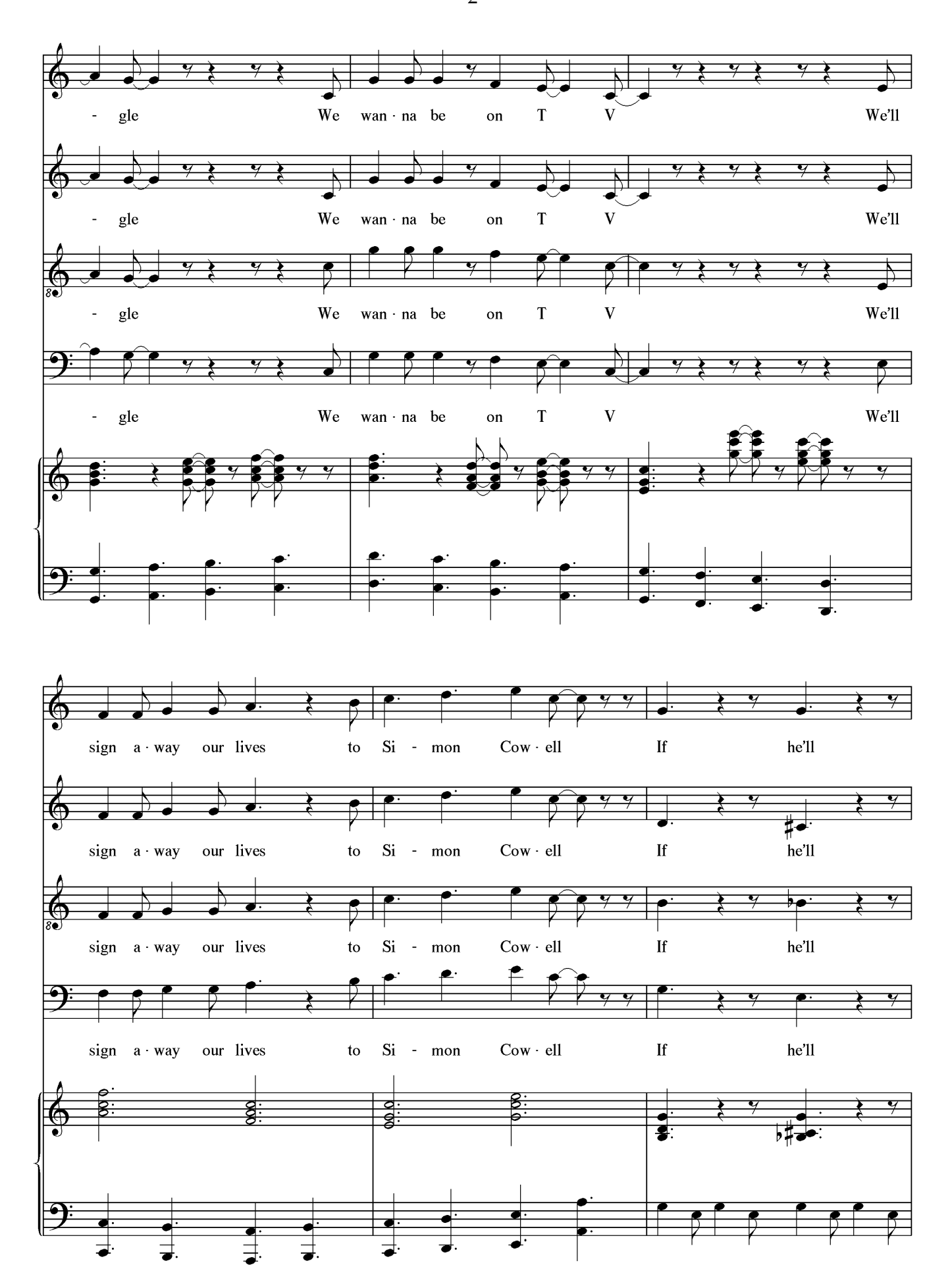
© 2009 F L Dunkin Wedd If this work is to be performed, please inform the composer in advance