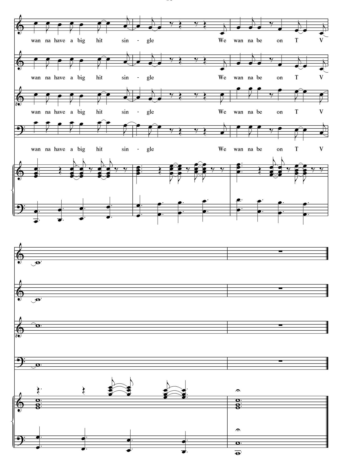
© 2009 F L Dunkin Wedd If this work is to be performed, please inform the composer in advance