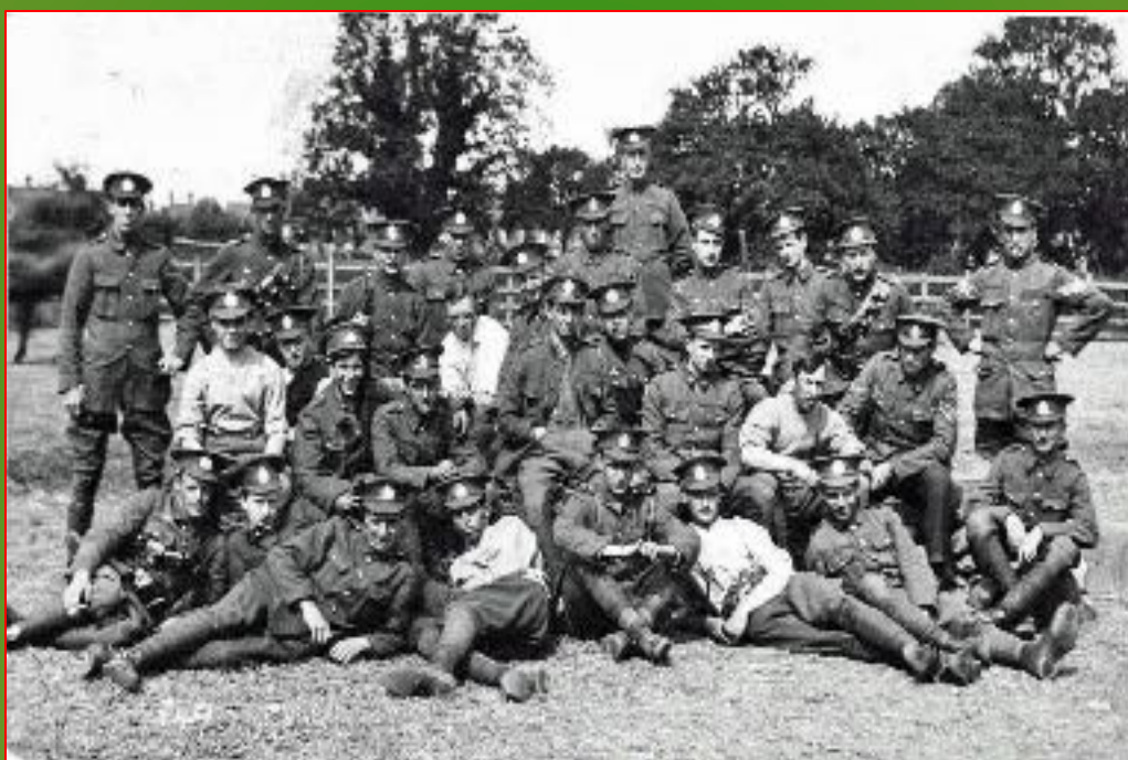
Company of Royal Fusiliers, relaxing at Swanton Morley, Norfolk, June 1915.