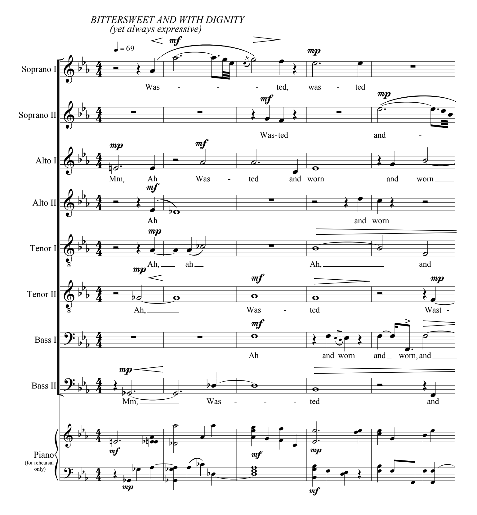
(N.B.:A comma indicates a breath and/or a general short break in the line, while a double-line caesura indicates a very clear section break)